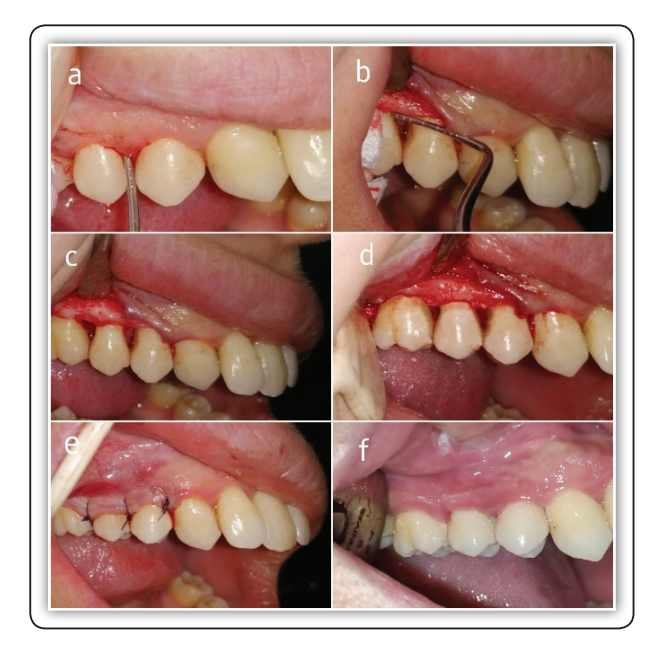
FIG (1) a; Pre-operative probing depth, b; (M-D) width of the defect, c; Flap reflection for the intrabony defect, d; Filling the intrabony defect with β-TCP mixed with ABS, e; Flap closure, f; Healing after 12 months.

The clinical indices measurements of Plaque index (PI)<sup>(10)</sup>, Gingival index (GI)<sup>(11)</sup>, Periodontal pocket depth (PPD) and Clinical attachment level (CAL) were recorded at baseline, 6 and 12 months after surgery by the same operator. Radiographic measurements of bone density, M-D width of the defect and depth of the defect (DB) were recorded also at baseline, 6 and 12 months after surgery using CBCT.