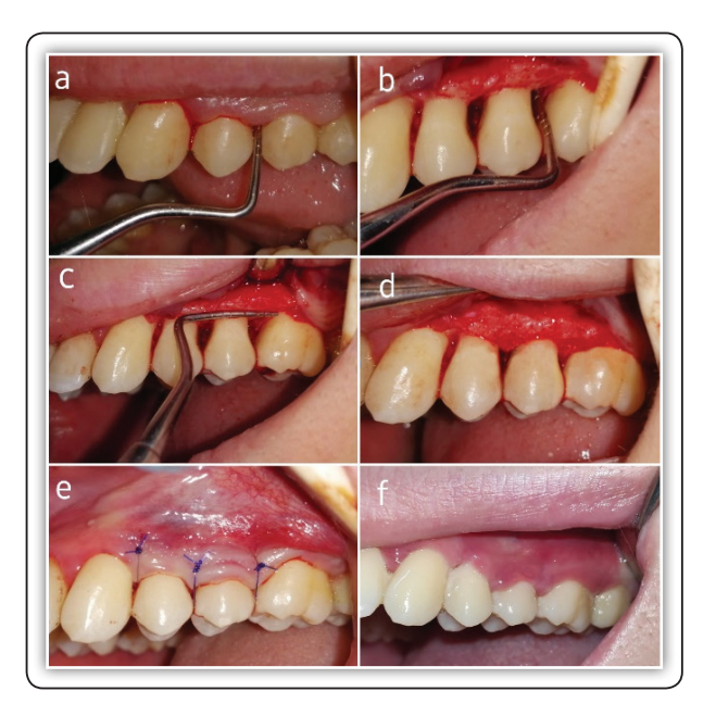
FIG (2) a; Pre-operative probing depth, b; Vertical Measurement of the defect, c; (M-D) width of the defect, d; Filling the intrabony defect with β-TCP, e; Flap closure, f; Healing after 12 months.