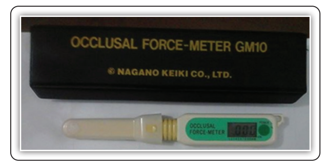
FIG (1) Occlusal force meter

The difference in biting force between two groups after one month and six months was determined, and statistical analysis was carried out using SPSS 20. (IBM, Armonk, NY, USA).