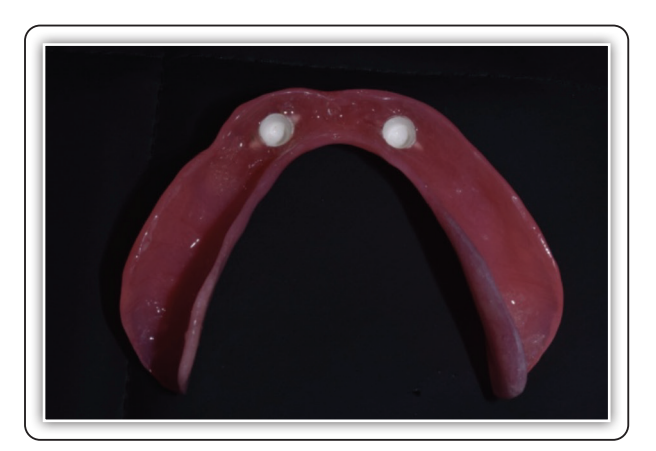
FIG (2) Direct incorporation of outer PEEK coping in the overdenture

The results of the two different denture telescopic attachments were recorded, calculated, and statistically analyzed.