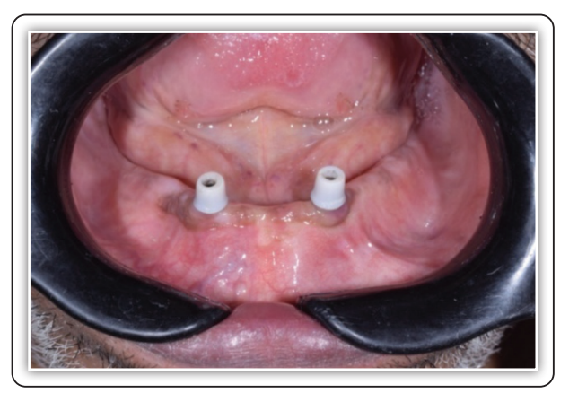
FIG (1) Primary crown placement in the patient mouth

The primary copings were tried in the mouth (fig. 1) and then sprayed with a thin layer of scan spray (Scantist 3D, Irland) on the cast and the outer surface. The cast and each primary coping were scanned separately with an extra-oral scanner to improve the data quality. The secondary crowns were designed with parallel walls and minimal thickness, and a space was created between them and the primary crowns. Mechanical projections were added to the secondary crowns to help them interlock with the denture base material. The design data were sent to the milling machine to mill the secondary crowns from PEEK(Brident, Germany).