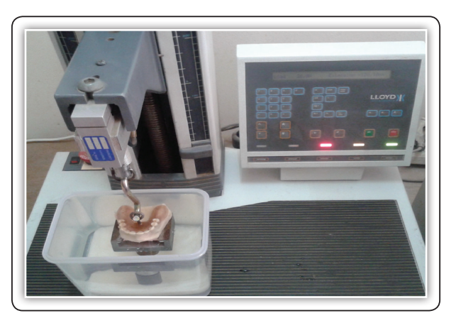
Fig. (1) Retentive force evaluation using the Universal testing machine.

The One-Way Analysis of Variance (ANOVA) test followed by post hoc analysis using LSD test showed that there was a highly significant difference of tensile load (in Newton) required to remove the RPD from the acrylic cast at the first time of use, after 60 cycles and after 360 cycles of insertion and removal between group A and B, between group A and C and group B and C.