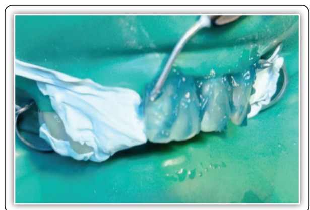
Fig. (3) Application of N etch