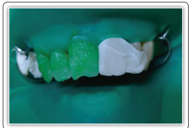
Fig. (2) Application of icon etch