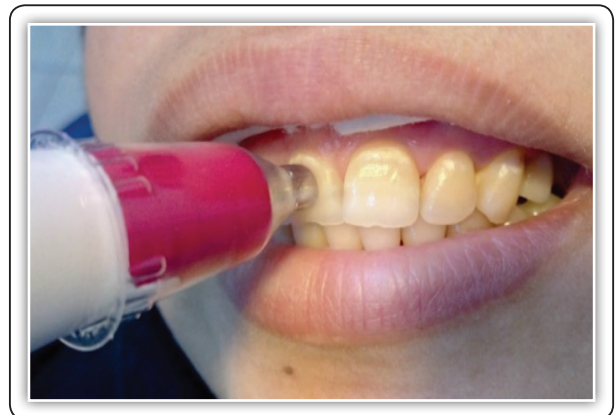
Fig. (1) Using Vita Easyshade V with infection control shield

For color evaluation both of ( \Delta L ) and ( \Delta C ) values were calculated as the difference between L and C respectively at each time interval as compared to base line values (pre-operatively).